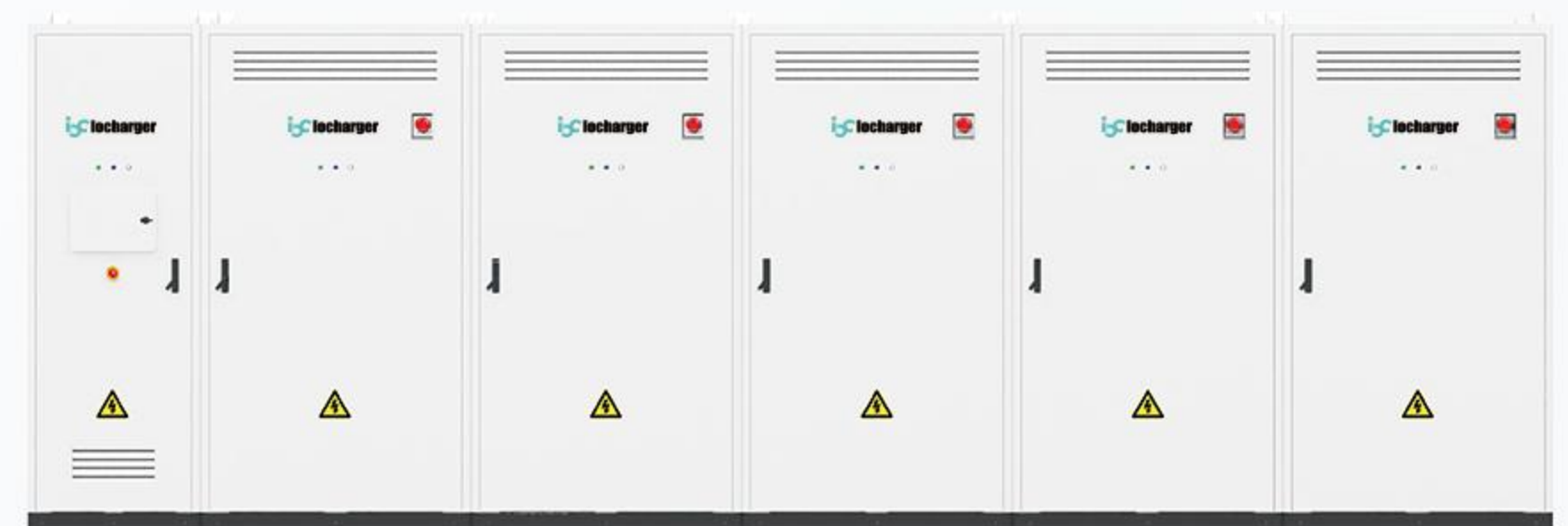
Easily expandable up to 5 units